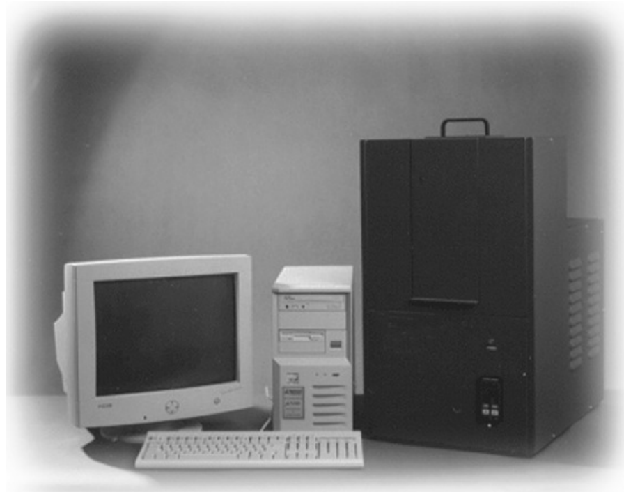
LFA 437 Microflash™

So-called guarded hot plates are based on a similar principle. In these systems, the heat source is located in the center between two samples with the cold plates lying outside. Electrical power applied to the main heater creates a temperature