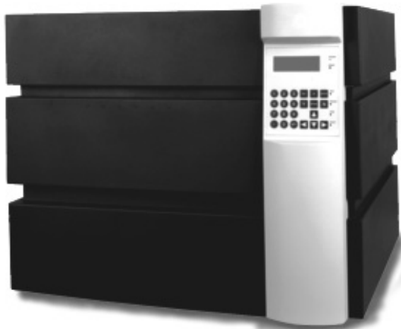
HFM 436 Lambda