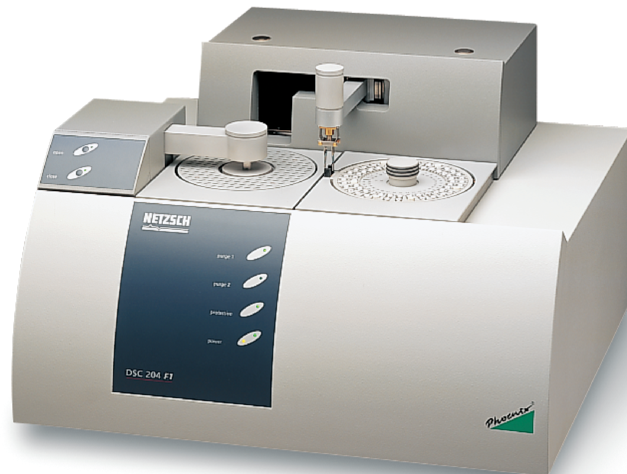
DSC 204 F1 Phoenix ® ASC